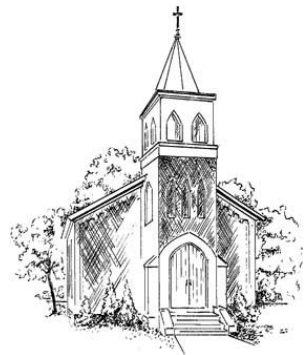
St. Stanislaus, Chatsworth Sunday 9:00 am